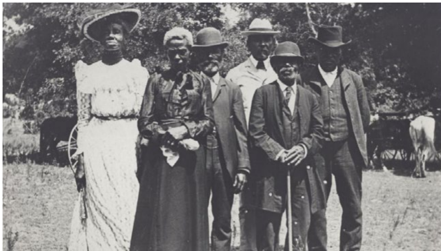
Emancipation Day celebration, June 19, 1900 held in «East Woods» on East 24th Street in Austin.