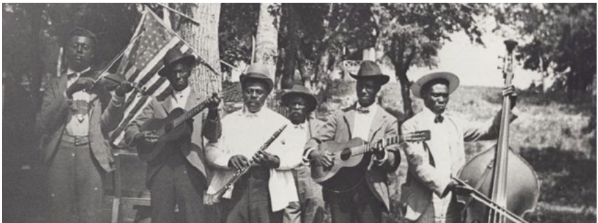
Juneteenth band. of celebrations in Eastwoods Park, Austin, 1900.